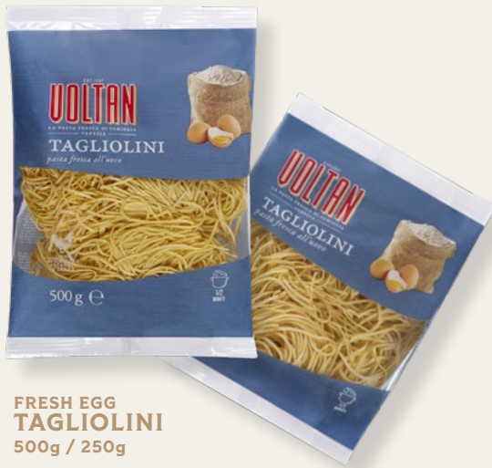
FRESH EGG TAGLIOLINI 500g / 250g