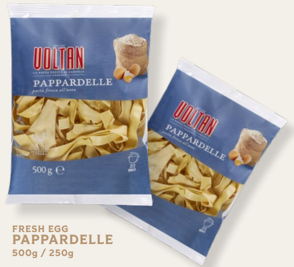
FRESH EGG PAPPARDELLE 500g / 250g