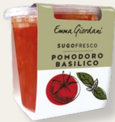
TOMATO & BASIL 300g