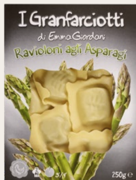
ASPARAGUS RAVIOLONI 250g