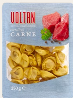
MEAT TORTELLINI 250g