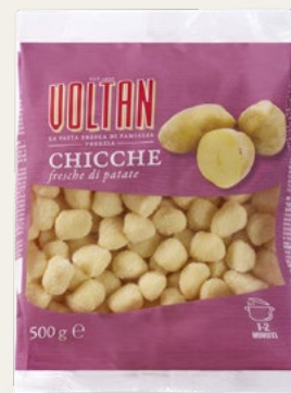
POTATO CHICCHE 500g