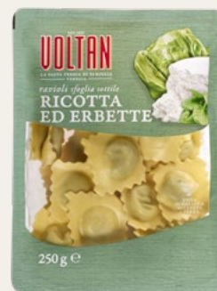
RICOTTA AND CHARD RAVIOLI Thin Pasta 250g