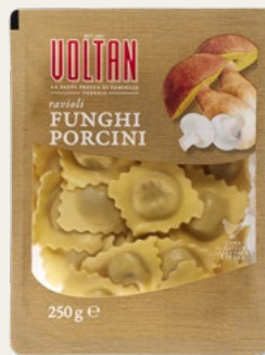
MUSHROOM PORCINI RAVIOLI 250g