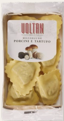
PORCINI AND BLACK TRUFFLE MEZZELUNE 250g