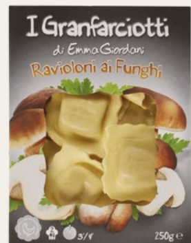
MUSHROOM RAVIOLONI 250g