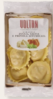
BUTTERNUT SQUASH AND SMOKED PROVOLA GIRASOLI 250g