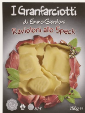
SMOKED HAM RAVIOLONI 250g