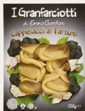
TRUFFLE CAPPELLACCI 250g