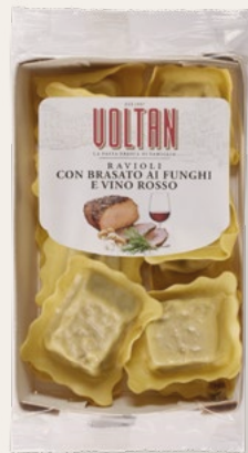
BRAISED BEEF, MUSHROOMS AND RED WINE RAVIOLI 250g