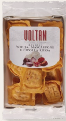
NDUJA, MASCARPONE AND RED ONION, RED PEPPER RAVIOLI 250g