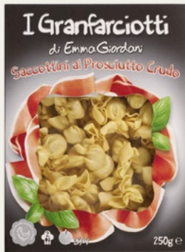
CURED HAM SACCOTTINI 250g