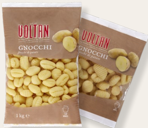
POTATO GNOCCHI 1 Kg / 500g