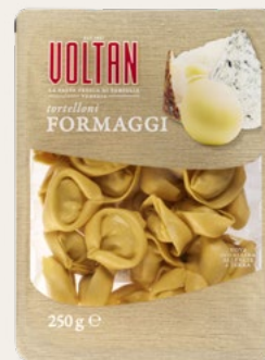
CHEESE TORTELLONI 250g