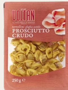
CURED HAM TORTELLINI Thin Pasta 250g