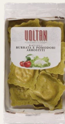
ROASTED TOMATO AND BURRATA RAVIOLI 250g