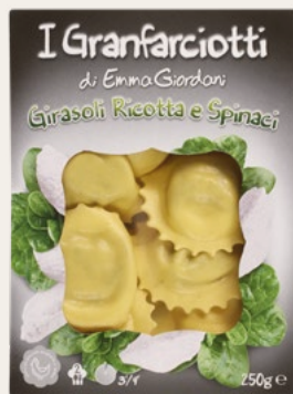
SPINACH & RICOTTA GIRASOLI 250g