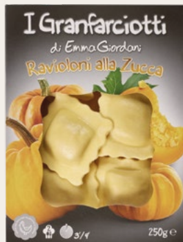
PUMPKIN RAVIOLONI 250g