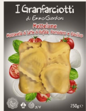
BUFFALO MILK MOZZARELLA & TOMATO MEZZELUNE 250g