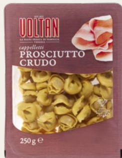
CURED HAM CAPPELLETTI 250g