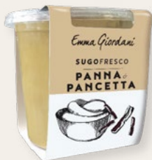
CREAM & BACON 300g