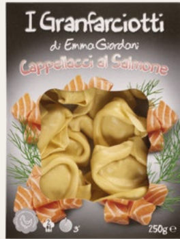
SALMON CAPPELLACCI 250g