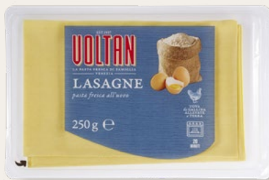
FRESH EGG LASAGNE 250g