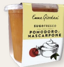
TOMATO & MASCARPONE 300g