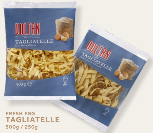
FRESH EGG TAGLIATELLE 500g / 250g