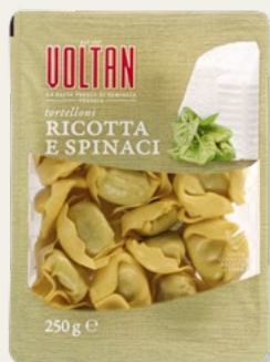
SPINACH & RICOTTA TORTELLONI 250g