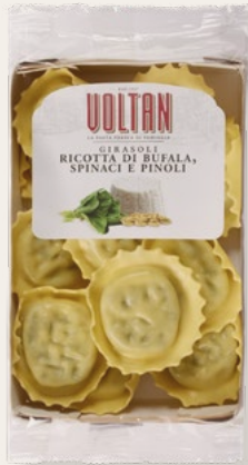
BUFFALO RICOTTA, SPINACH AND PINENUTS RAVIOLI 250g