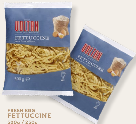
FRESH EGG FETTUCCINE 500g / 250g